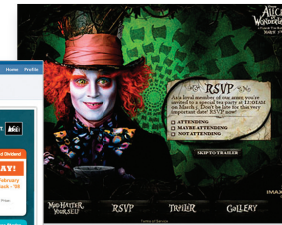
Facebook Connect Application