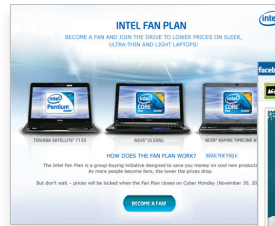
Native Facebook Application